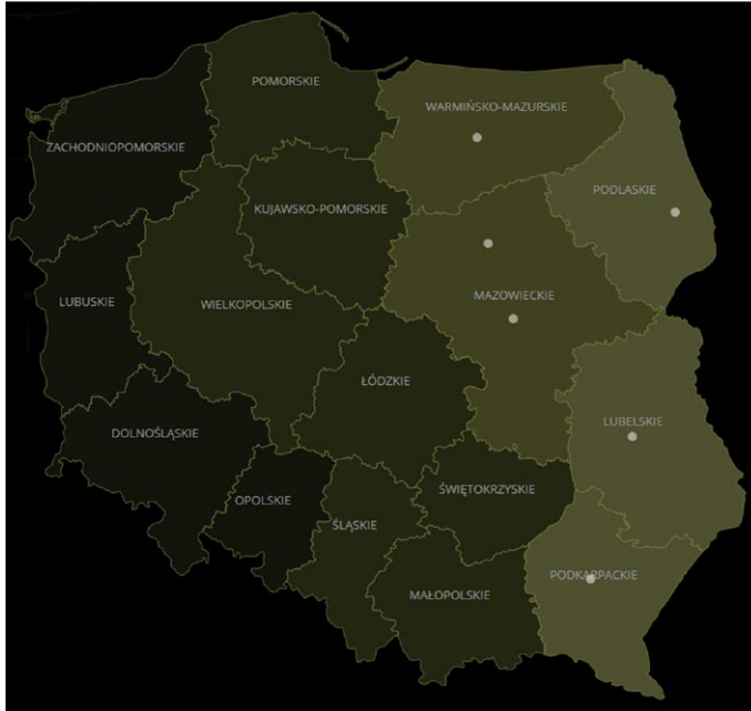
Fig. 1. Territorial Defence Wax Development Plans